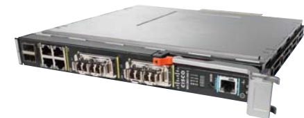
Figure 2 Cisco Catalyst Blade Switch 3100 Series

The Cisco Catalyst Blade Switch 3100 Series is another example of why most companies choose Cisco to meet their switching requirements. The Cisco Catalyst Blade Switch 3100 Series combines Cisco Catalyst heritage with product innovation to meet the unique demands of today's blade server environment.