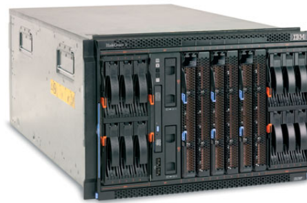
BladeCenter S chassis

The JS23 and JS43 Express blades have been pre-configured and tested by IBM and are based on proven technology. Utilizing a 4.2 GHz 64-bit POWER6 processor and available in a four-core or eight-core configuration including a new 32 MB Level 3 cache for each core pair, and simultaneous multi-threading, they are designed to deliver outstanding performance and capabilities at compelling prices. With faster and more reliable double data rate 2 (DDR2) memory options and support for eight to 16 memory DIMM slots along with Serial Attached SCSI (SAS) disk subsystem, the BladeCenter JS23 and JS43 Express blades are designed for increased uptime and enhanced performance. Exploiting the newest in high performance and energy-efficient solutions like Solid State Disk Technology, the JS23 and JS43 offer remarkable performance for I/O intensive applications. And, for those that require fast and frequent data access, the JS23 and JS43 offer the utmost in easy-to-manage,