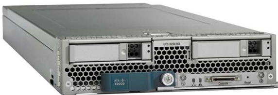
Figure 1. Cisco UCS B200 M3 Blade Server

The Cisco UCS B200 M3 Blade Server continues Cisco's commitment to delivering uniquely differentiated value, fabric integration, and ease of management that is exceptional in the marketplace. The Cisco UCS B200 M3 further extends the capabilities of Cisco UCS by delivering new levels of manageability, performance, energy efficiency, reliability, security, and I/O bandwidth for enterprise-class applications: