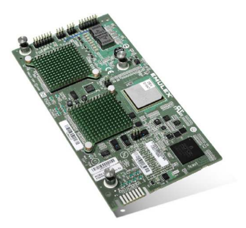
Figure 1. Cisco UCS M71KR-E Emulex Converged Network Adapter

Designed specifically for the Cisco UCS blades, the adapter provides a dual-port connection to the midplane of the blade server chassis. The Cisco UCS M71KR-E uses an Intel 82598 10 Gigabit Ethernet controller for network traffic and an Emulex 4-Gbps Fibre Channel controller for Fibre Channel traffic all on the same mezzanine card. The Cisco UCS M71KR-E presents two discrete Fibre Channel host bus adapter (HBA) ports and two Ethernet network ports to the operating system (Figure 1).