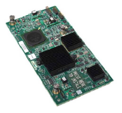
Figure 1. Cisco UCS M71KR-Q QLogic Converged Network Adapter

Designed specifically for the Cisco UCS blades, the adapter provides a dual-port connection to the midplane of the blade server chassis. The Cisco UCS M71KR-Q uses an Intel 82598 10 Gigabit Ethernet controller for network traffic and a QLogic 4-Gbps Fibre Channel controller for Fibre Channel traffic, all on the same mezzanine card. The Cisco UCS M71KR-Q presents two discrete Fibre Channel host bus adapter (HBA) ports and two Ethernet network ports to the operating system (Figure 1).