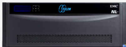
EMC Isilon NL400

The challenge of cost-effectively storing and managing data is an ever-growing concern. You also have to weigh the cost of storing certain aging data sets against the need for quick access. Meeting this challenge requires a solution that bridges the gap between high-performance but costly, primary storage and inexpensive, but management-intensive, off-line storage solutions.