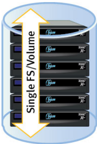
OneFS operating environment