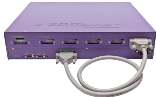
EPS-C2 Connected to a Summit X440