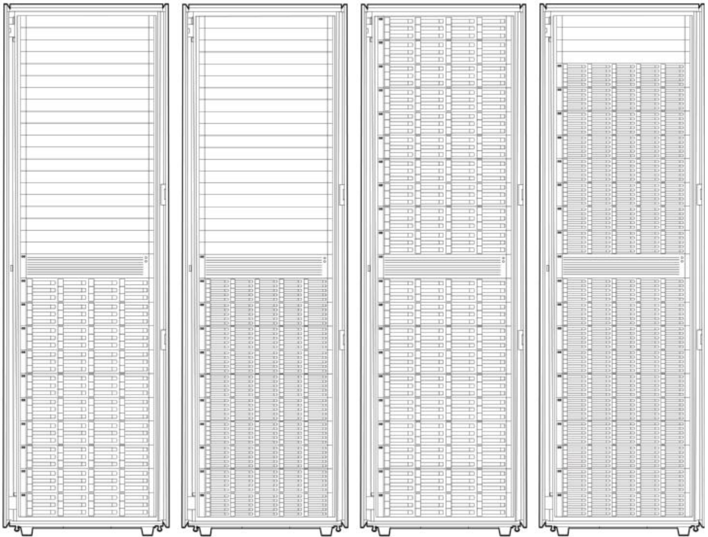
EVA P6350 2C10D