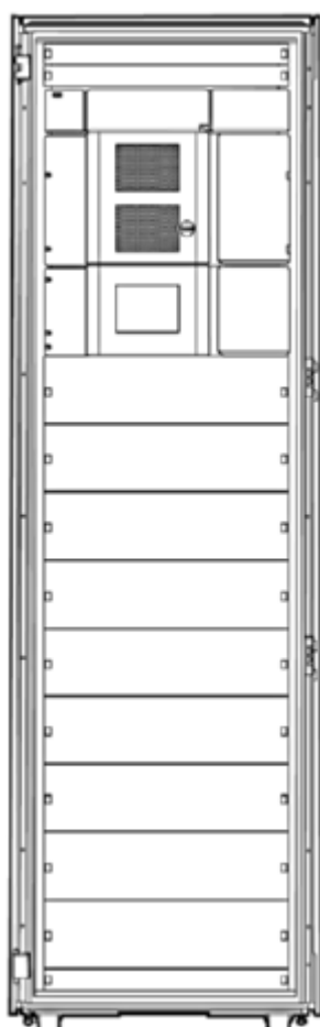
103e Configuration or rack-ready EML71e