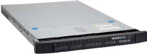
EMC Isilon A100 Performance Accelerator