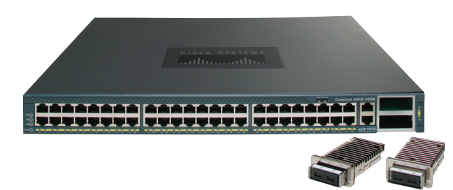
Figure 1. Cisco Catalyst 4948-10GE Switch

The Cisco® Catalyst® 4948-10GE Switch (Figure 1) is a fixed configuration switch offering high-performance, rack-optimized server switching for data centers of all sizes.