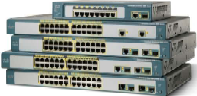
Figure 1. Cisco Catalyst Express 520 Series Switches

Figure 2 shows typical Cisco Catalyst Express 520 Series Switch deployment scenarios.