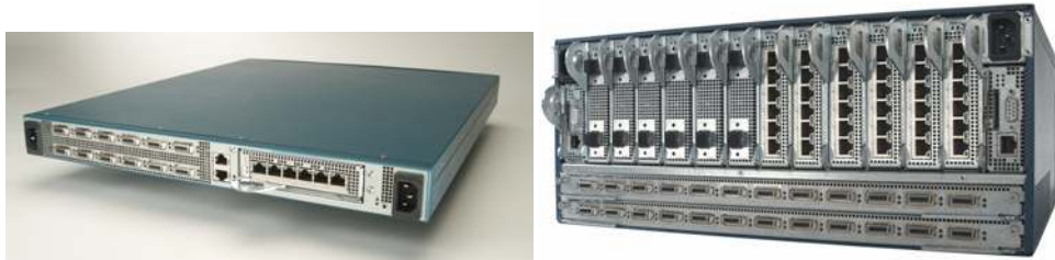
Figure 3. Cisco SFS 3001 and 3012 Rear Views

The Cisco SFS 3001 also meets high-availability requirements with redundant, hot-pluggable power and cooling. The optional expansion module is also hot-pluggable. Multiple Cisco SFS 3001s can also be deployed in redundant pairs to prevent single points of failure at the system level.