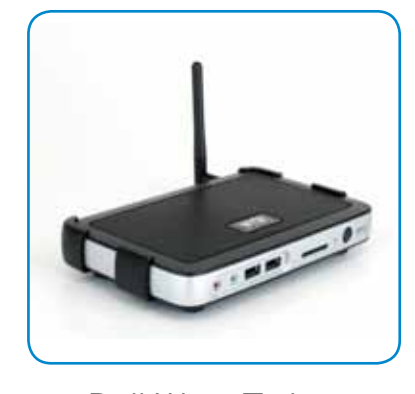
Dell Wyse T class hardware specifications

Want to learn more? Simply click the relevant icon.