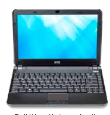
Dell Wyse X class c family

Download carbon calculators, fact sheets and white papers from here: www.wyse.com/green