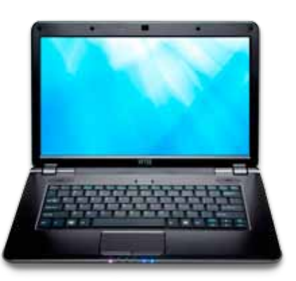
Dell Wyse X class m family