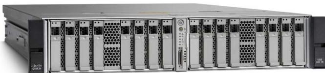
Figure 1. Cisco UCS C420 M3 Rack Server