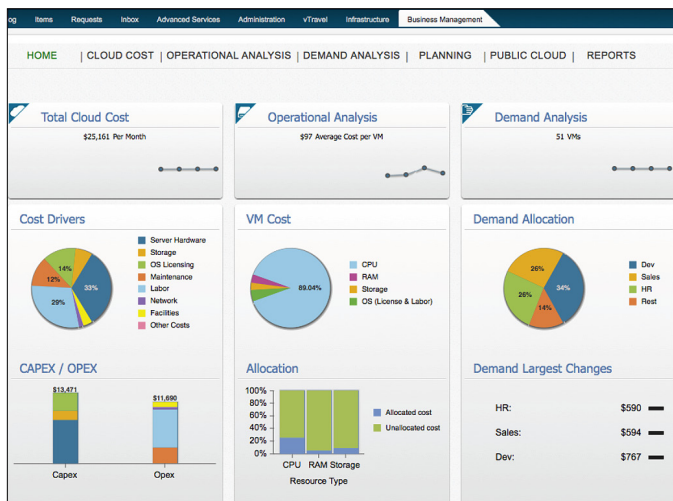
Figure 2. Business Management for Cloud

VMware IT Business Management Suite can help address these challenges, by providing the cost of a virtual machine and utilization of shared resources to help you better manage demand, budget, CapEx/OpEx; driving accountability over cloud resources to lower TCO.